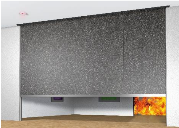
Image 1: Textile fire curtains are compact, flexible and can achieve high insulating fire protection when designed properly.