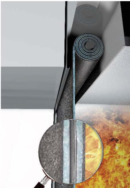
Image 2: isoGLAS® FTI by Frenzelit is a multilayer fire protection fabric that can be used to achieve EI60 fire protection.