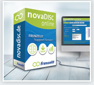
novadisc.de ONLINE Design Software